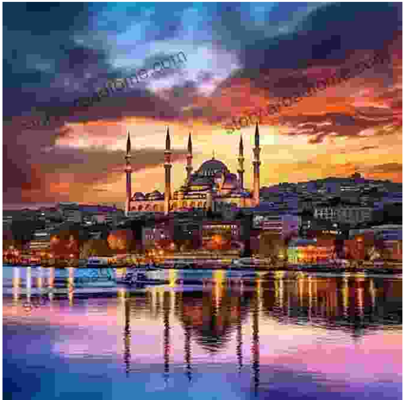
Unveiling the Enigma of the Janissaries

As a result, readers are transported to the Ottoman Empire as if they were living and breathing alongside Mehmet. They witness the bustling streets of Constantinople, feel the adrenaline of battle, and experience the cultural exchange that shaped the empire's unique identity.