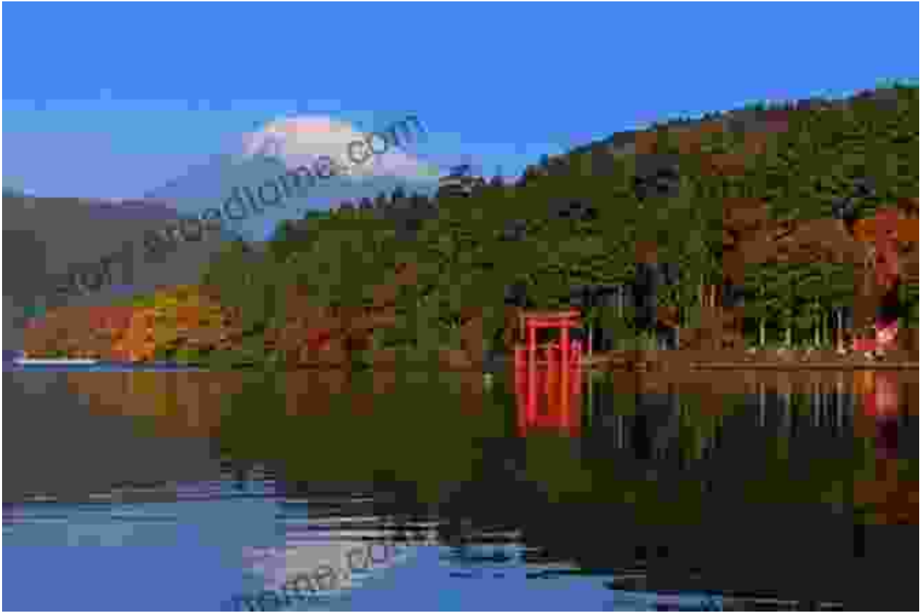
Tranquil Lake Ashi, nestled amidst lush greenery