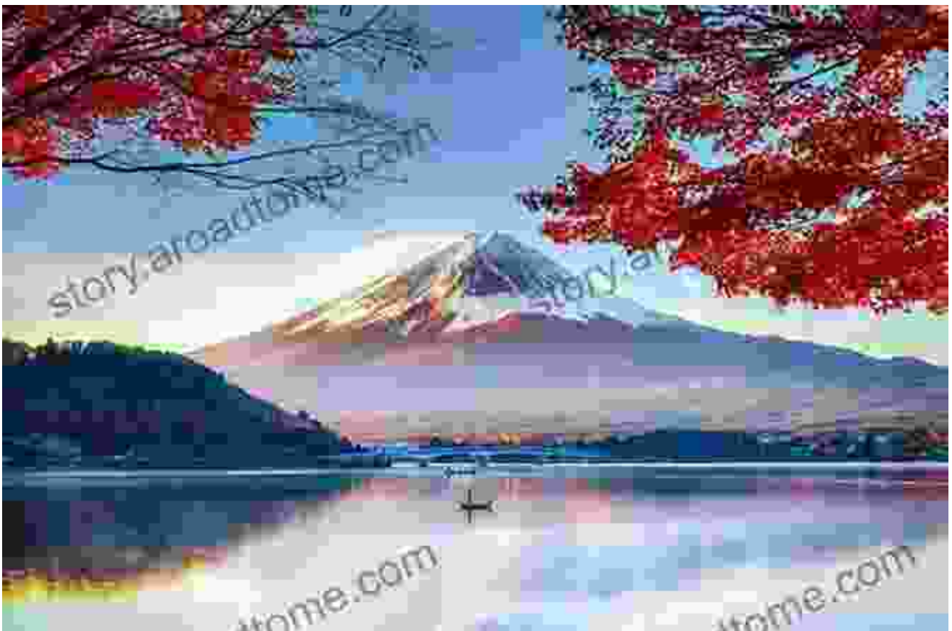
Majestic Mount Fuji, an iconic symbol of Japan

Free Download your copy today and embark on an unforgettable visual odyssey. Let the landscapes of Japan captivate your senses, inspire your dreams, and ignite your wanderlust.